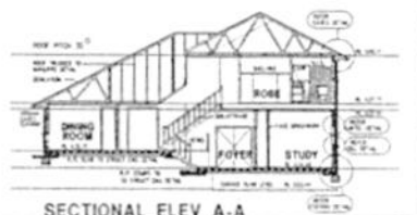
SECTIONAL ELEV A-A