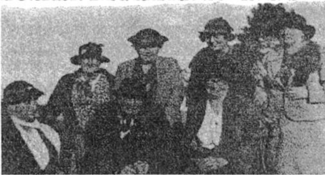
1937 photo of :